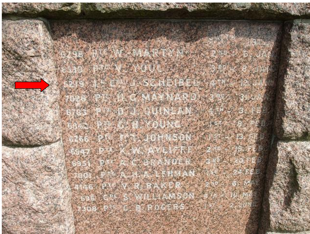
Memorial to 1st Training Battalion A.I.F. at Durrington Cemetery