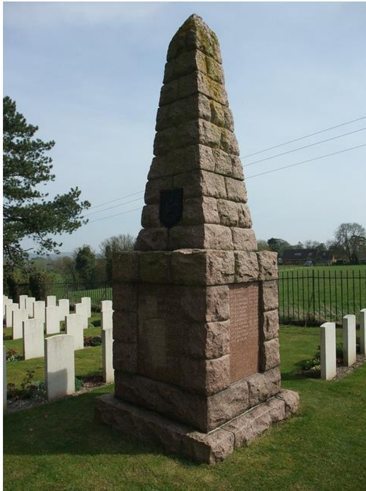
Memorial to 1st Training Battalion A.I.F. at Durrington Cemetery