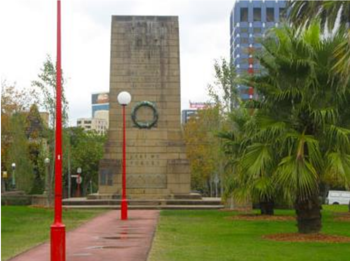
North Sydney War Memorial